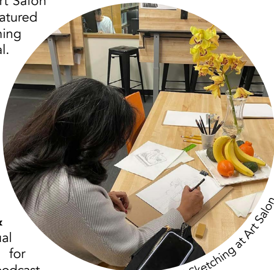
Still Life Charcoal Sketching at Art Salon

www.redwoodcity.org/departments/library/makerspace