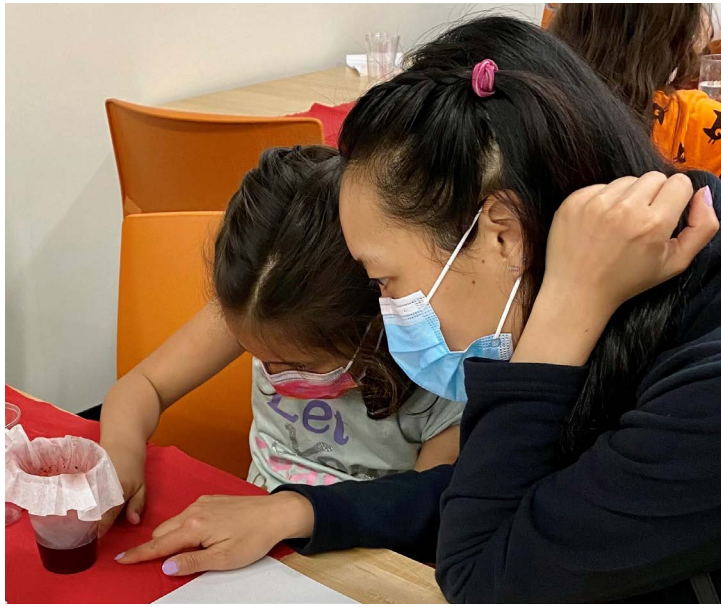
Mother and daughter working together in the Makerspace